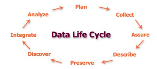
Figure 1. DataONE Data Life Cycle model.

We now turn to two lifecycle models conceived within the context of Big Data. DLCLs are five community-specific initiatives of the Large Scale Data Management and Analysis (LSDMA)<sup>6</sup> project of the Helmholtz Association of research centers in Germany. Each initiative provides domain-specific data analysis tools and cross-cutting data management services, and optimizes the scientific data life cycle for the community it serves (van Wetzel, et al., 2012, and Jung et al., 2014). These research communities include: energy (smart grids, battery research, and fusion research), earth and environment (climate model and earth observation satellite data), health (the virtual human brain map), key technologies (synchrotron radiation, nanoscopy, high throughput microscopes, electron-microscope imaging techniques), and structure of the matter (large instruments, heavy ion research, elementary particle physics).