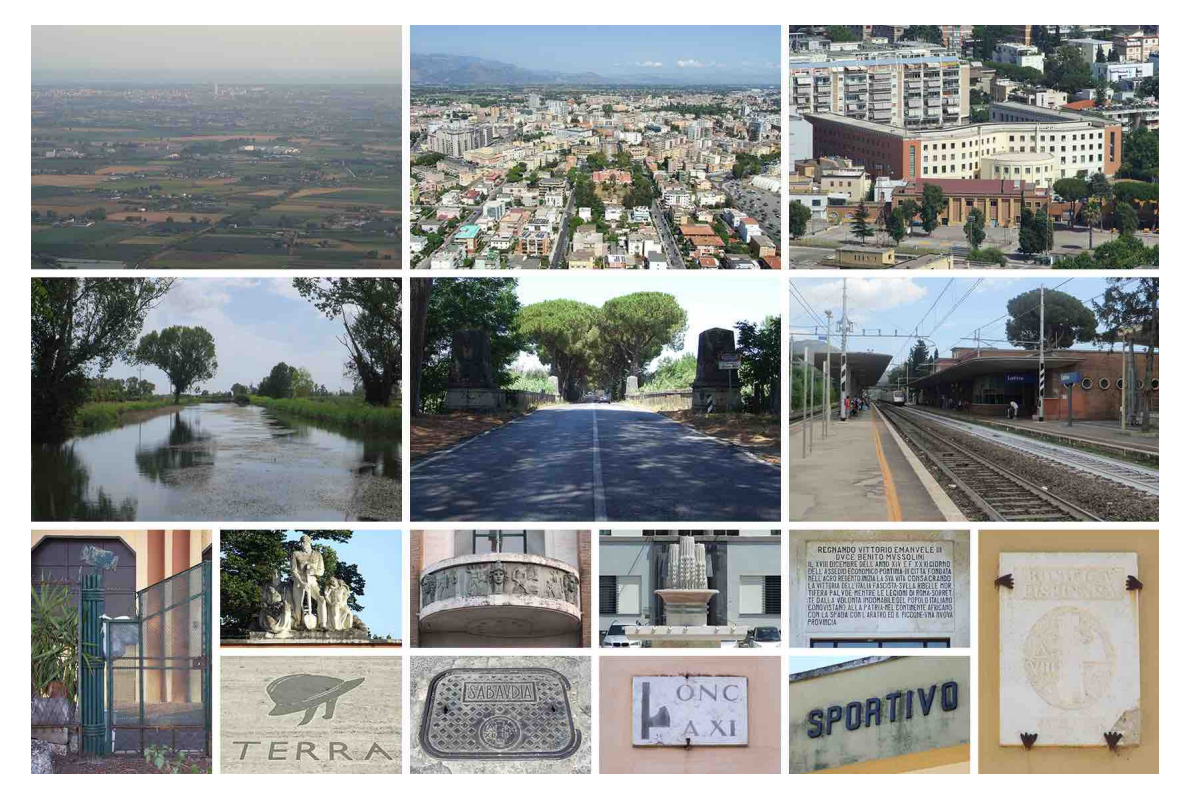
Figure 2. A composite image showing the 16 photographs selected for the archive, arranged from right to left, top to bottom to demonstrate the macro-micro nature of Latina's symbolic elements.

As mentioned above, at the first meeting between Cole and Harland a number of potential solutions for a digital archive were discussed. It was recommended by Cole that the Loughborough Data Repository would be the best solution. The particular advantages of the data repository were: the visualisations of the images when published; the ability to create individual projects as part of a larger group; the ability to include members who were not part of the University; and the clear and easy way to upload visual data.