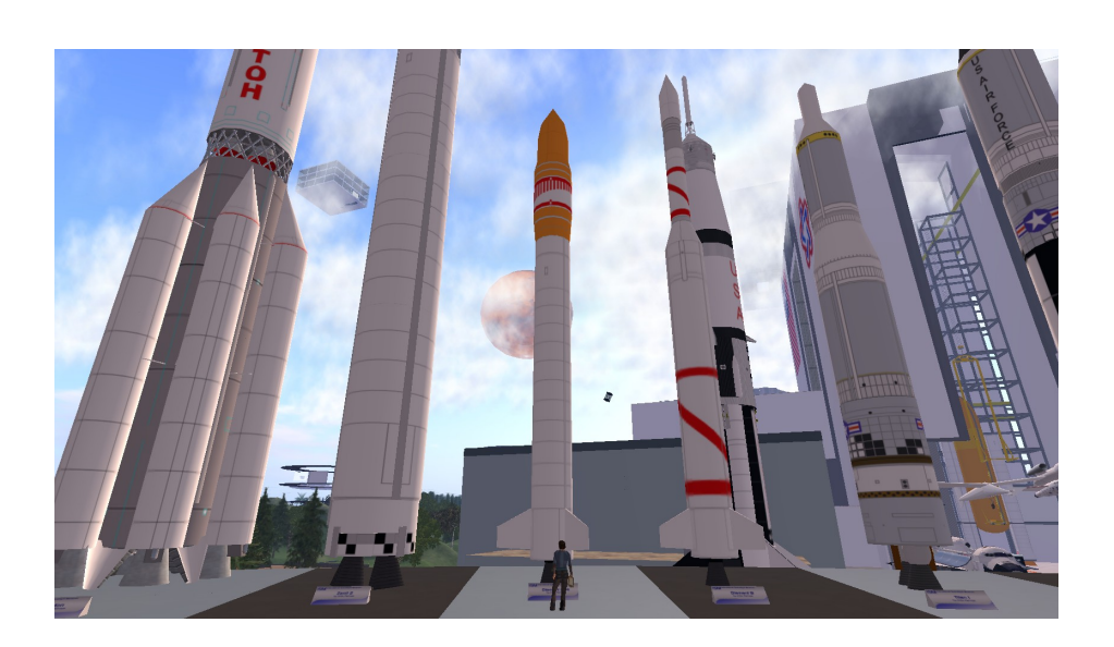
Figure 2. International Space Flight Museum.

As the majority of the information about objects in Second Life that we download is stored in XML format, and the texture files downloaded for those objects are all in the JPEG 2000 format, the necessary representation information for Second Life content is actually relatively small. Additional representation information may be required for context information objects (such as harvested websites). Provenance information, at this point, is extremely minimal; we record the date and time a region