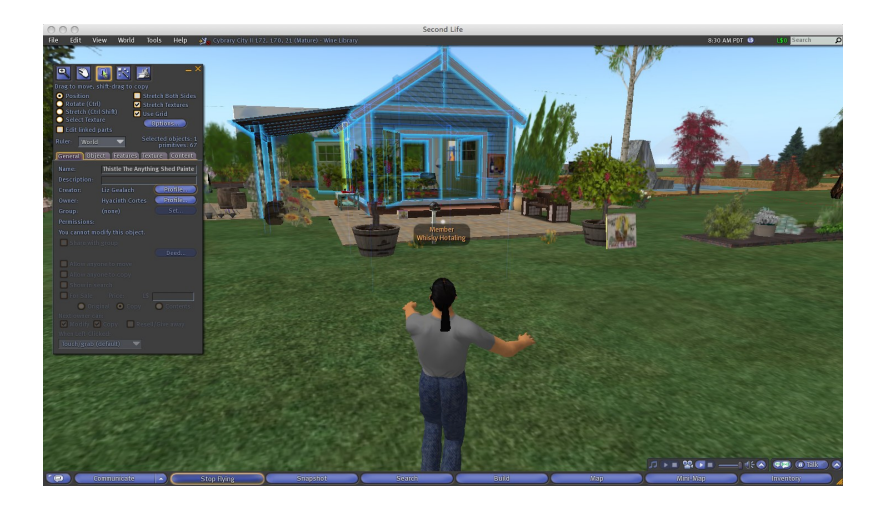
Figure 1. Manipulating Objects in Second Life.

Objects in Second Life are created by linking together one or more shape primitives, or "prims". The primitives come in eight basic shapes (box, prism, cylinder, sphere, torus, ring, tube and sculpted) that can be further modified from their default shapes. A prim is more complex than its name might imply, as each prim has an associated inventory that can contain scripts, notecards, textures and other items. By combining these primitives, residents can build an astonishing variety of complex objects. Textures (image files applied to the faces of the primitives) give objects the illusion of possessing even more detail. Each object has a set of metadata elements associated with it, including the identity of the individual who originally created the object (the intellectual property rights holder), known as the Creator, and the individual who has possession of the object, known as the Owner. See Figure 1 for an example of the editing pane displaying metadata for a complex object, a house.